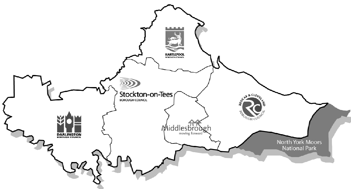
Figure 1 The Tees Valley